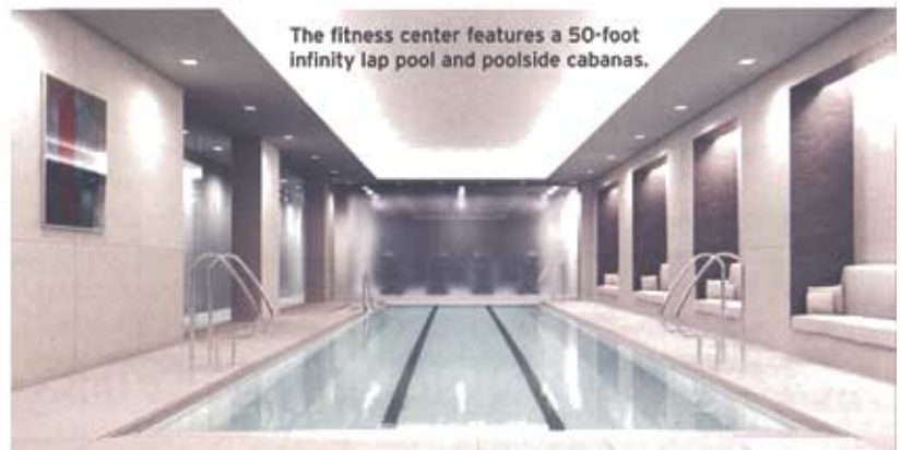
The fitness center features a 50-foot infinity lap pool and poolside cabanas.

Though the expected occupancy date is not until fall 2008, prospective buyers can peruse the customizable residence finder on The