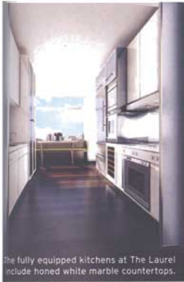
The fully equipped kitchens at The Laurel include honed white marble countertops.