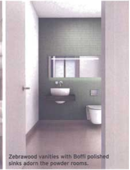
Zebrawood vanities with Boffi polished sinks adorn the powder rooms.